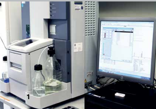
1 Biacore device