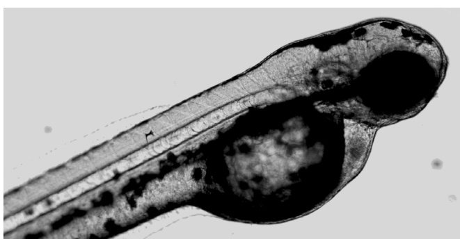
Danio rerio model organism

Pesticides, biocides or pharmaceuticals can display adverse effects in non-target organisms. This may threaten populations with far-reaching consequences for the ecosystem. Therefore, European legislation requires manufacturers to provide data for environmental risk assessment of active substances for registration. The commonly applied OECD tests are time and costconsuming and utilize a substantial number of animals. Thus, they are conducted only in the final stage of substance development, bearing the risk of failing registration due to adverse environmental effects. The Eco'n'OMICs project aims at an early ecotoxicological risk prediction for development compound classes based on their induced molecular changes in aquatic model organisms. We apply OMICs to identify gene expression changes as molecular biomarkers for a number of ecotoxicologically well characterized model substances covering a broad range of modes-of-action (MoA).