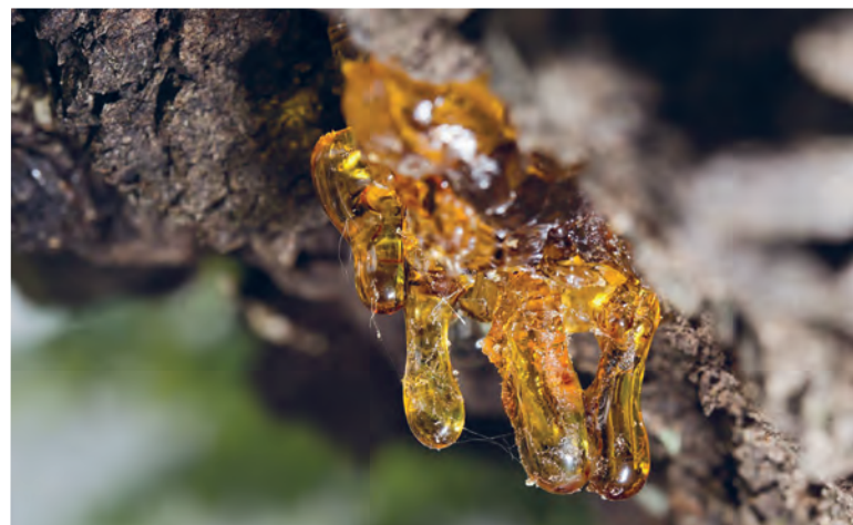
Tree resin as an example of UVCB

Fraunhofer IME meets these requirements through its experience in developing guidelines, its interdisciplinary approach and its technical equipment, the latter being state of the art. ■