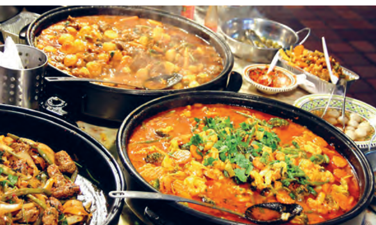
Processed food | photo: PantherMedia / jahina

The aim of this first joint project will be an exemplary assessment and elucidation of the fate of nutrients during food processing and digestion, which will allow the partners to use these procedures for industrial customers and public authorities as a tool for their food safety and quality issues.