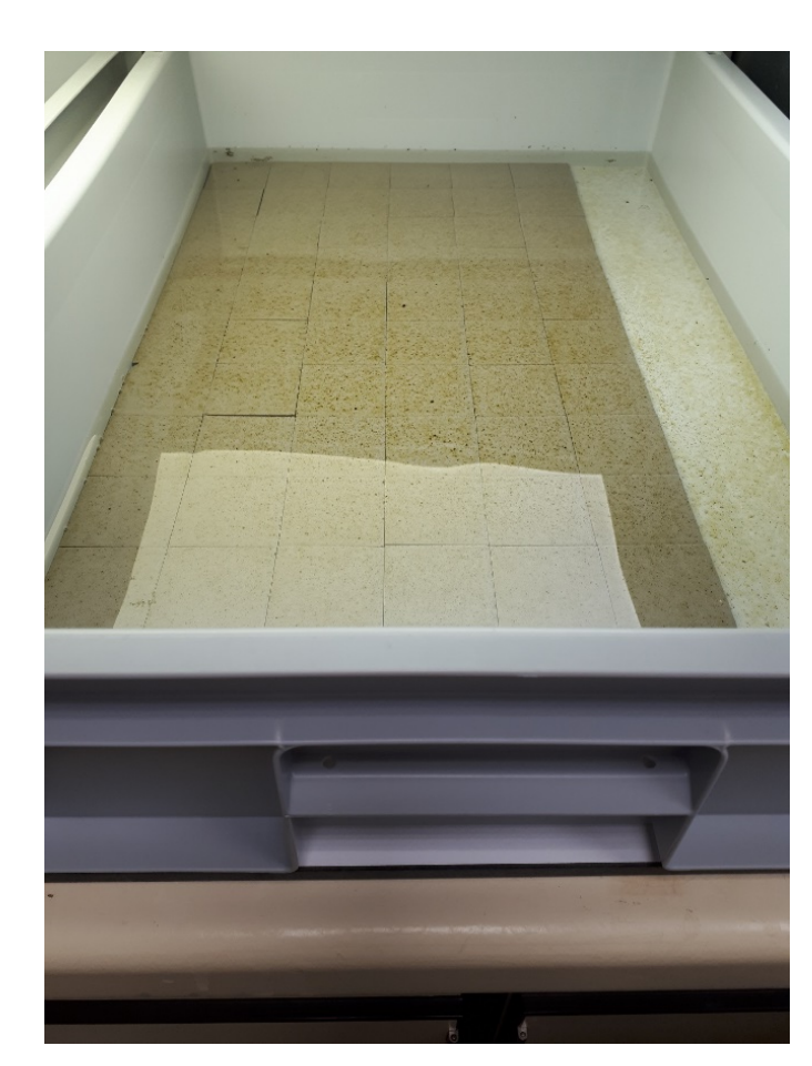
Figure 2: Test vessel for chronic toxicity testing with C. dipterum

Figure 3: Navicula pelliculosa grown on tiles as food source