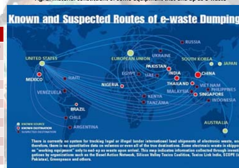
Fig. 2: Transboundary routes of e-waste transport 1