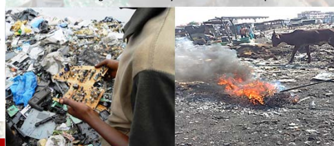
Fig. 3: Informal recycling activities in developing countries